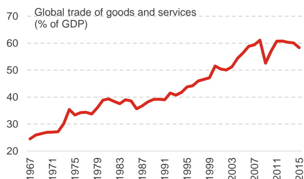
Chart 2: Global trade activity has peaked