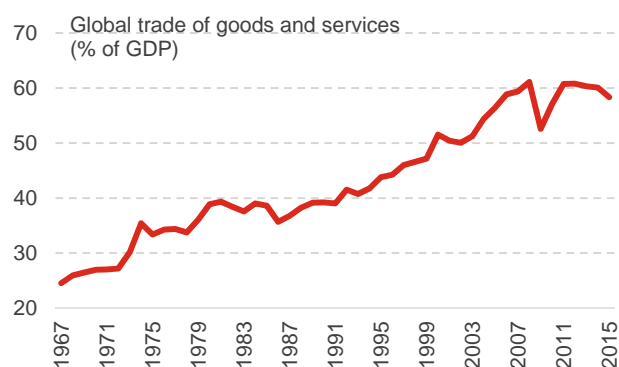
Chart 2: Global trade activity has peaked